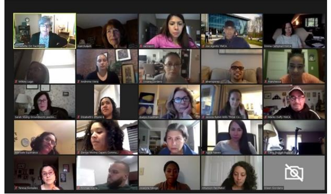
In May, we proudly graduated 15 magnificent local professionals. As they bring their wisdom into this new world, they will be an important force to confront new challenges and explore possibilities.

Instead, we migrated to a virtual platform to complete our last three workshops and to explore new Board matches.